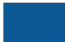
717 Grand Slam