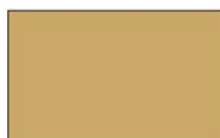
737 Forest Gold