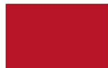
721 Relay Red