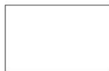
714 Snow White